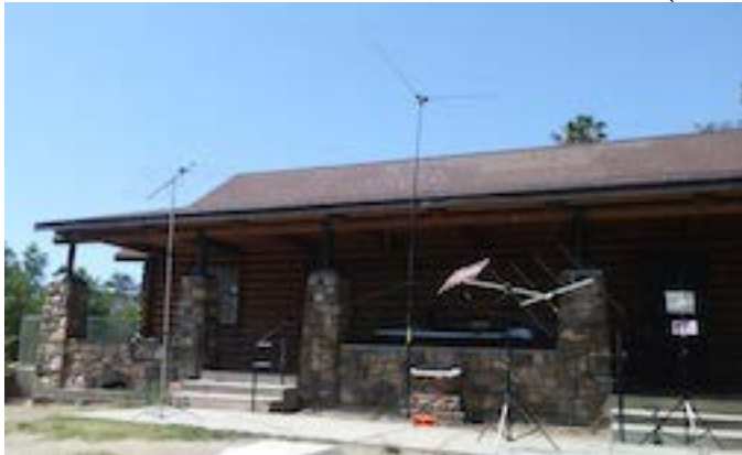
Operating area with antennas