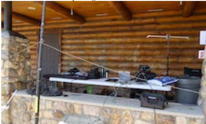
20 Meter setup