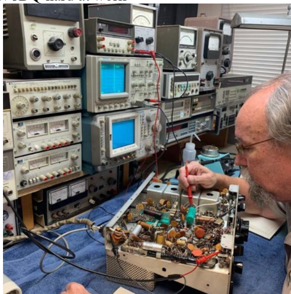
W6DQ hard at work