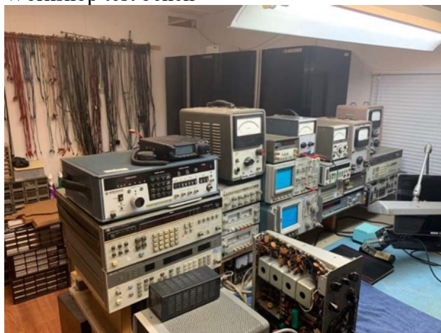
Workshop test bench