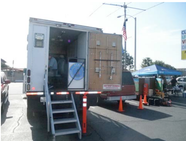
Northrup Grumman Amateur Radio Club Emergency Truck

The annual Ham Jam was held on Saturday, July 8 at and sponsored by HRO Anaheim. As is typical it was on a beastly hot day, but attendance was still good. Below are a few pictures of some activities.