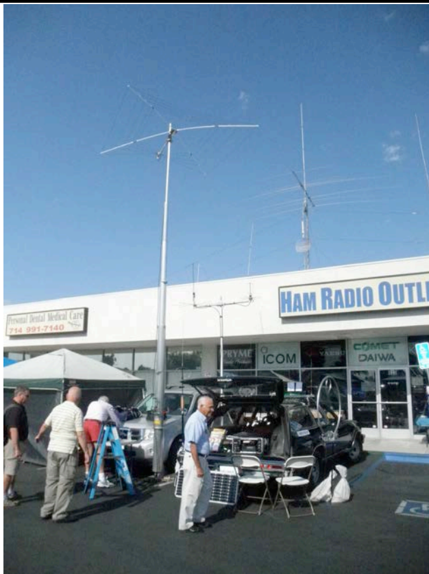
CW Station and WB6NOA's famous Emergency Communication vehicle