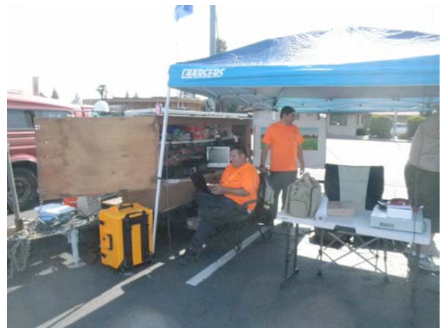
Amateur Radio Tower Trailer Team (ARTTT)