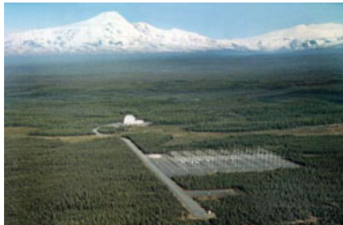
A Picture of the Alaskan HAARP array.