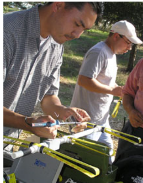
Antenna work at a recent ARDF function.