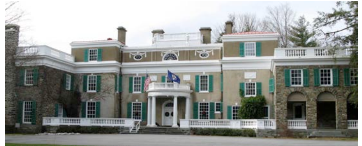
FDR Presidential Library